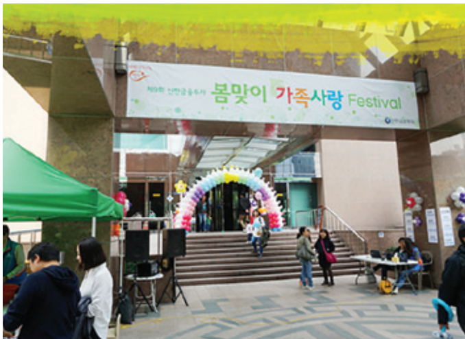
Shinhan Investment Corp., Spring Festival

Every year, Shinhan Card conducts events for establishing ties with outstanding suppliers. In 2015, it conducted Smart Finance Education with outstanding suppliers. When signing contracts, Shinhan Bank attaches Agreement on Integrity and Shinhan Financial Group code of conduct for suppliers in order to encourage compliance with rules and CSR activities. Moreover, in order to express gratitude to suppliers and to maintain consistent relationships of shared development, Shinhan Bank invited 60 companies to conduct external lectures and discussion meetings. Furthermore, 'All that Shopping Mall', an online shopping mall of Shinhan Financial Group, provides channels and services to sell and advertise products for outstanding small businesses, suppliers, and small organizations that have high quality products but have weak distribution and marketing channels. For small businesses with small operation workforces, Shinhan Card supports sales channels and experiences by facilitating bypassed entry to large companies such as Small & Medium Business Distribution Center.