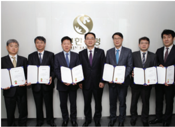
Shinhan Life Insurance, Award Ceremony for Certifying outstanding IT suppliers

In order to improve satisfaction of suppliers through regular communication, Shinhan Life Insurance has conducted a policy for selecting outstanding IT suppliers to conduct exchange events since 2014, and has been carrying out certificate award ceremonies and semi-annual discussion meetings, etc. When calculating expected price, the general affairs department does so by considering the annual inflation rate. Shinhan Life Insurance invites suppliers once or twice a year to communication events. The company also reviews extension of contracts and extends contract durations if the actual expense spent is below 75% of the contract expense, in order to practice compassionate finance and promote cooperative relationships.