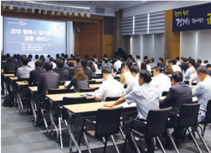
Shinhan Bank, Financial Seminars with Employees of Suppliers