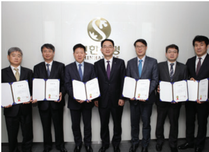
Shinhan Life Insurance, Award Ceremony for Certifying outstanding IT suppliers

In order to improve satisfaction of suppliers through regular communication, Shinhan Life Insurance has conducted a policy for selecting outstanding IT suppliers to conduct exchange events since 2014, and has been carrying out certificate award ceremonies and semi-annual discussion meetings, etc. When calculating expected price, the general affairs department does so by considering the annual inflation rate. Shinhan Life Insurance invites suppliers once or twice a year to communication events. The company also reviews extension of contracts and extends contract durations if the actual expense spent is below 75% of the contract expense, in order to practice compassionate finance and promote cooperative relationships.