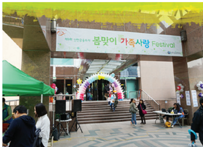
Shinhan Investment Corp., Spring Festival

Shinhan Life Insurance plans to select outstanding IT suppliers and award certificates, and to make consistent expansion in supporting outstanding suppliers by assessing their satisfaction rate. The company will carry out various monthly activities in 2016 such as Family Month event and Hope Day, in addition to existing activities targeted to improve operators' satisfaction. Shinhan Life Insurance will also make efforts to improve satisfaction of operators by making consistent improvements on data processing and business processes designed to improve the working environment of operators.