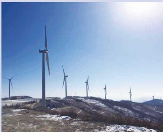
Pyeongchang Wind Power Plant

Shinhan Financial Group provided financial support on renewable industries that do not use fossil fuel - such as solar power and wind power generation industries - through technological financing and PF(Project Financing). In 2015, Shinhan Financial Group provided financial support amounting to KRW 82.4 billion for Environment-friendly generation projects in Sangju Floating Solar Power Plant, Gangwon Solar Park, Chuncheon Solar Power Plant, and Gowon Wind Power Plant. The floating photovoltaic project produces electricity by installing solar power modules on water surfaces, producing a CO 2 reduction effect that is equivalent to planting 1.2 million pine trees every year.